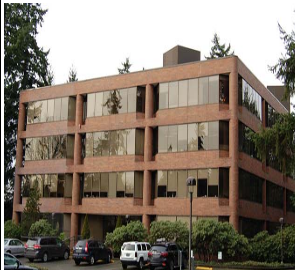
View from 156 th NE Street

Alternatively, you can come along 156th NE heading to Bel-Red Rd and the parking lot entrance is on your right just before the intersection.