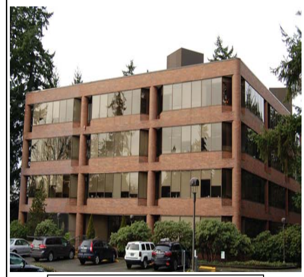
View from 156<sup>th</sup> NE Street

Alternatively, you can come along 156th NE heading to Bel-Red Rd and the parking lot entrance is on your right just before the intersection.